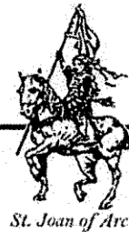
St. Joan of Arc