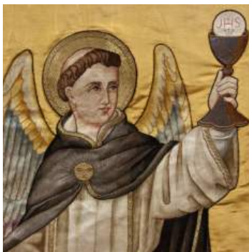
From an embroidered banner in St Dominic's, Newcastle.

1376 "Because Christ our Redeemer said that it was truly his body that he was offering under the species of bread, it has always been the conviction of the Church of God, and this holy Council [of Trent] now declares again, that by the consecration of the bread and wine there takes place a change of the whole substance of the bread into the substance of the body of Christ our Lord and of the whole substance of the wine into the substance of his blood. This change the holy Catholic Church has fittingly and properly called transubstantiation. "