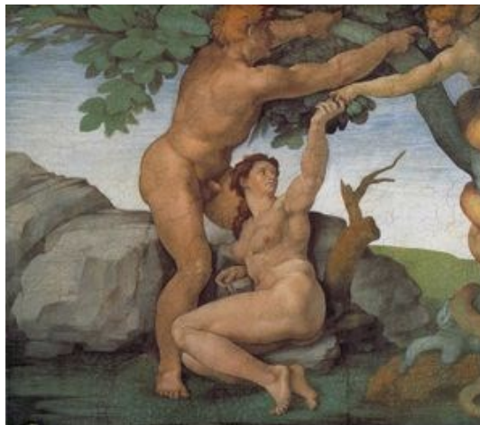
From Michelangelo’s Original Sin and Expulsion from Paradise , Sistine Chapel