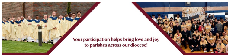
Your participation helps bring love and joy to parishes across our diocese!

LOVE that Strengthens | JOY that Sustains